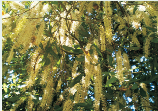
TwinN used in organic macadamia, NSW