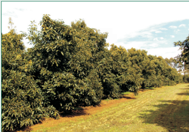
TwinN used in organic avocado, Blackbutt, Qld

Tree crops grown with TwinN application include avocado, pecan, macadamia, apples, peach, cherry, nectarines, apricot and other stone fruit, blueberry, apple, citrus, mango and others. Growers use TwinN to enable decreased nitrogen fertiliser inputs, increased yield, and improved tree health and vigour. Longer term improvements in soil health and fertility are also important to TwinN users. The following results show some of the experiences of growers who use TwinN in tree crops.