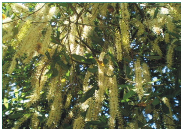
TwinN used in organic macadamia, NSW