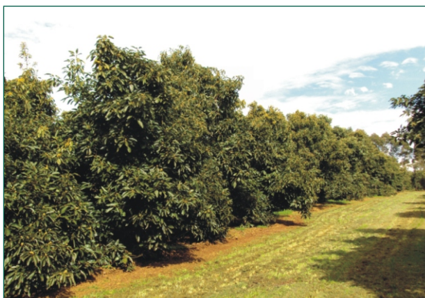
TwinN used in organic avocado, Blackbutt, Qld

Tree crops grown with TwinN application include avocado, pecan, macadamia, apples, peach, cherry, nectarines, apricot and other stone fruit, blueberry, apple, citrus, mango and others. Growers use TwinN to enable decreased nitrogen fertiliser inputs, increased yield, and improved tree health and vigour. Longer term improvements in soil health and fertility are also important to TwinN users. The following results show some of the experiences of growers who use TwinN in tree crops.